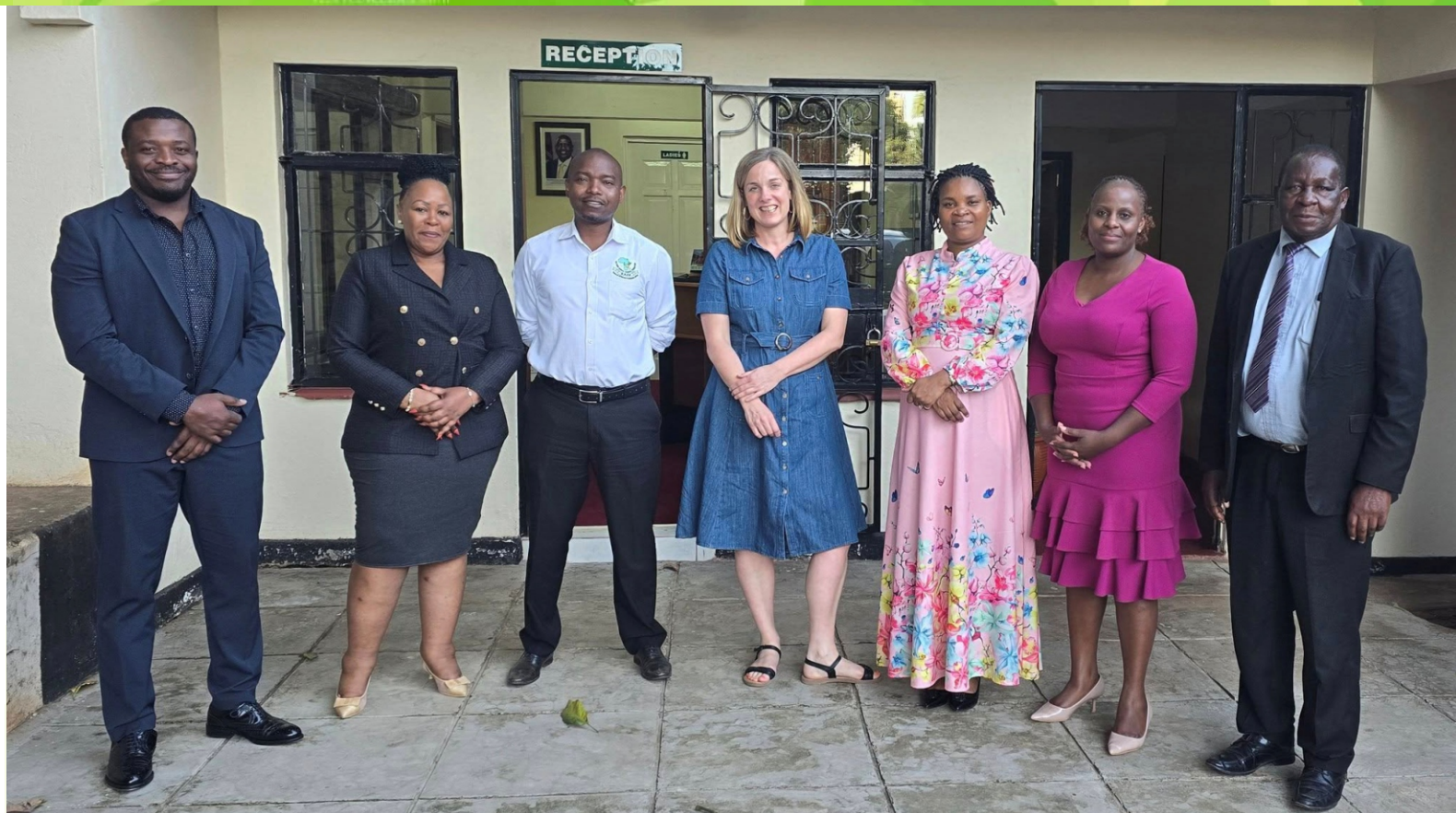
EAFF officials pose with the GIZ team in a group photo.