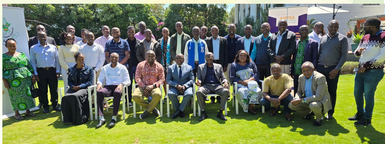
Participants pose for a group photo during the potato sector session

However, the sector continues to face significant challenges, including limited access to high-quality seeds, frequent pest outbreaks, climate-related vulnerabilities, and price volatility. To tackle these issues, governments, researchers, and private enterprises are implementing various initiatives, such as expanding certified seed production, training farmers in advanced techniques, and developing climate-resilient potato varieties. Mechanization is also on the rise, with programs like Hello Tractor's cooperative leasing model helping to reduce labor costs and improve efficiency. Additionally, innovative solutions, such as Seed Delight Farm's aeroponic technology in Nakuru, Kenya, are enhancing seed quality and optimizing yields.