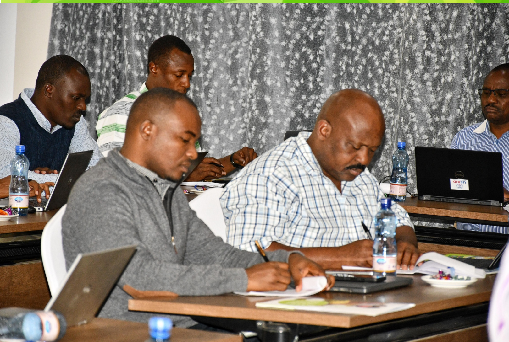
A section of participants taking notes during the Workshop

N aivasha, Kenya – The Eastern Africa Farmers' Federation (EAFF) hosted a five-day Regional Dairy and Potato Sector Knowledge Management Workshop from January 13 to 17, 2025. The event brought together key stakeholders from Tanzania, the Democratic Republic of Congo, Kenya, Uganda, and Rwanda to foster knowledge exchange, discuss policy reforms, and enhance business linkages within the dairy and potato sectors.