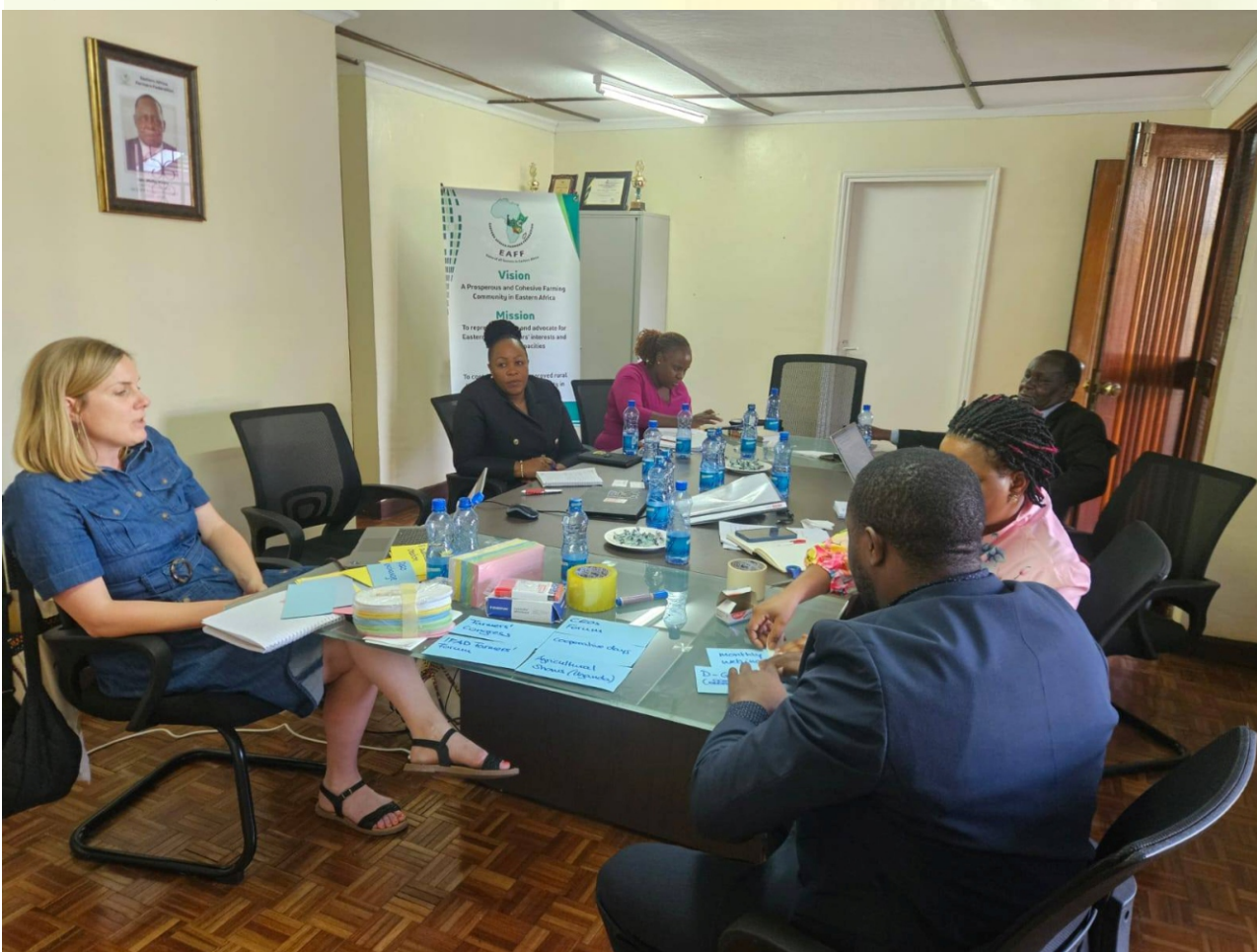
During the meeting session

Policy Advocacy: Supporting farmer organisations in contributing to policy formulation at national, regional, and international levels.